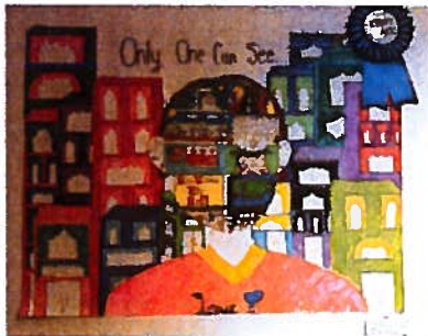
1st Place Indira Moshi Grade 6