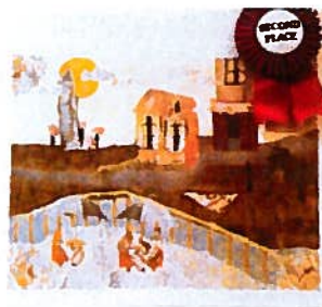
2nd Place Jeremiah Cuadro 5th grade