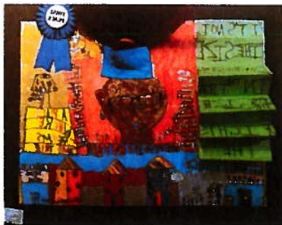
1st place ShirIron West 5th Grade