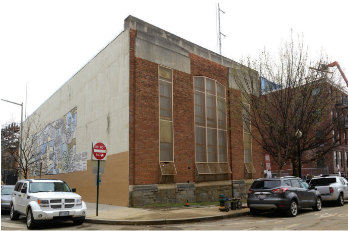
Current Champlain Substation