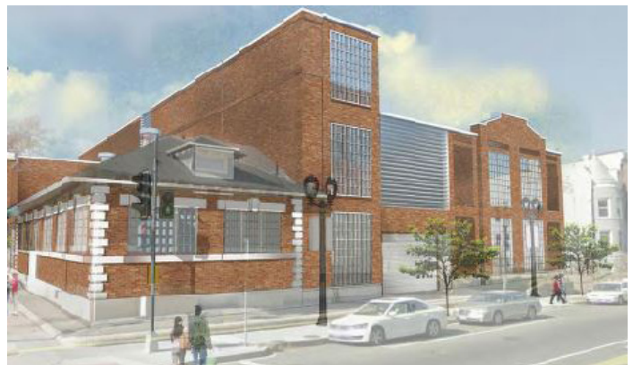
Harvard Substation Rendering