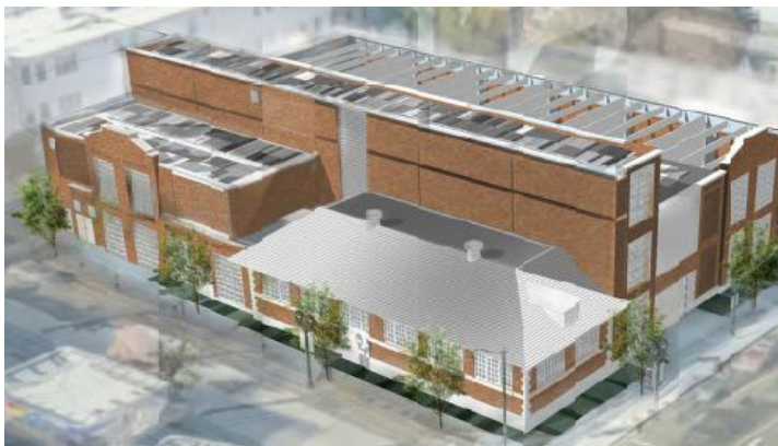
Harvard Substation Rendering