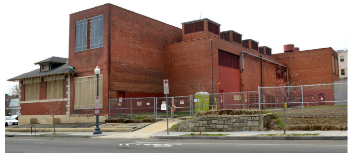
Current Harvard Substation

We welcome the opportunity to work with residents and business owners to gather public feedback and input. We are committed to keeping customers informed every step of the way through the project webpage, community meetings, and social media. To find a community meeting in your neighborhood, visit www.pepco.com/CapitalGrid .