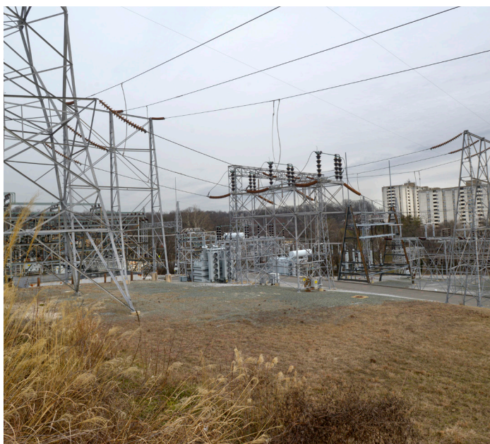
Current Takoma Substation