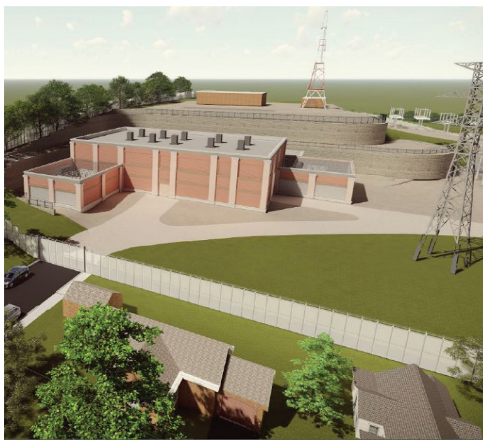
Takoma Substation Rendering